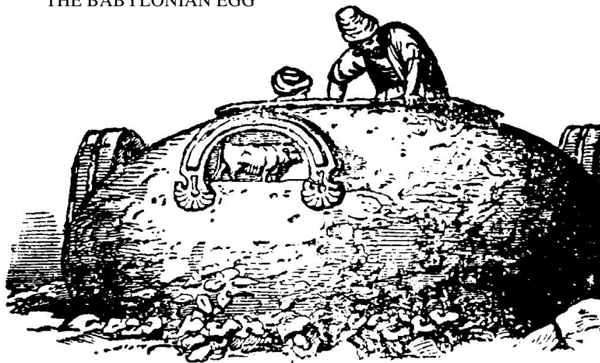
THE BABYLONIAN EGG

The first-century B.C. Greek historian, Diodorus Siculus, testifies that "Orpheus introduced FROM EGYPT, the greatest part of the mystical ceremonies, the ORGIES that CELEBRATE THE WANDERINGS OF CERES, and the whole fable of the shades below."