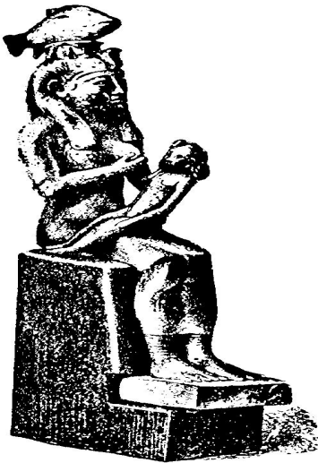
Isis and Horus

ERES , goddess of the growth of foodplants, worshipped, alone or with the god CERUS, OVER A CONSIDERABLE PART OF ITALY....Her cult was early overlaid by that of DEMETER, who was widely worshipped in SICILY AND MAGNA GRAECIA, cf. DEMETER. On the advice of the Sibylline Books, a cult of CERES LIBER and LIBERA was introduced into Rome in 496 B.C., to check a famine. LIBER and LIBERA seem to REPRESENT THE IARCHOS AND KORE of the Eleusinian cult. The ritual of this worship was largely if not wholly Greek. The temple, which was built on the Aventine in 493 B.C., and was of Etruscan shape, but decorated by Greek artists, became a centre of plebeian activities, religious and political.