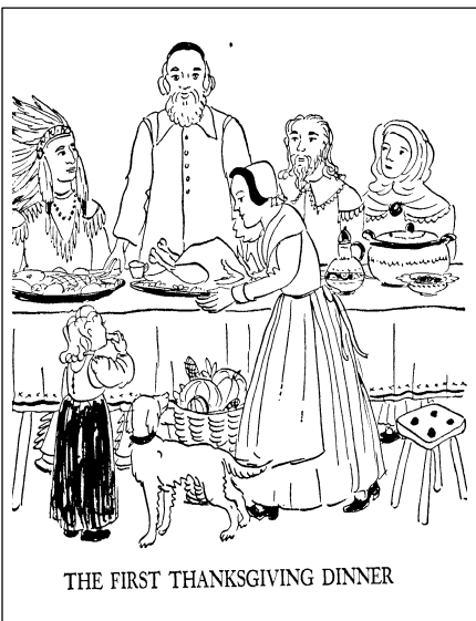
THE FIRST THANKSGIVING DINNER

Is this day of Thanksgiving, then, so HOLY AND PURE that everyone can now observe it with a CLEAR conscience before the Almighty God?